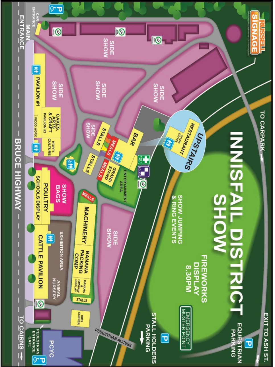
Thursday, 11 th July and Friday, 12 th July 2019 105 th Annual Show