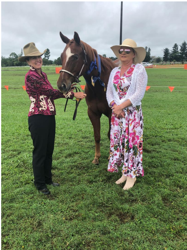
Thursday 7 th July and Friday 8 th July, 2022 107 th Annual Show