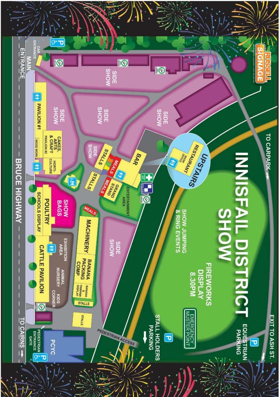
Thursday, 7 th July and Friday, 8 th July 2022 107 th Annual Show