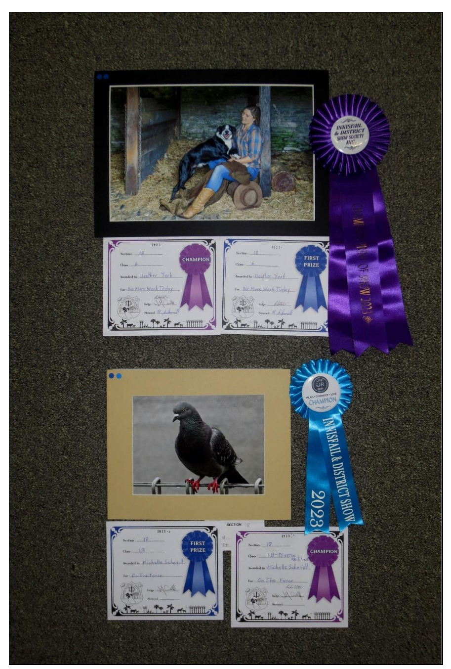
Thursday, 11<sup>th</sup>July and Friday, 12<sup>th</sup> July 2024 109<sup>th</sup> Annual Show