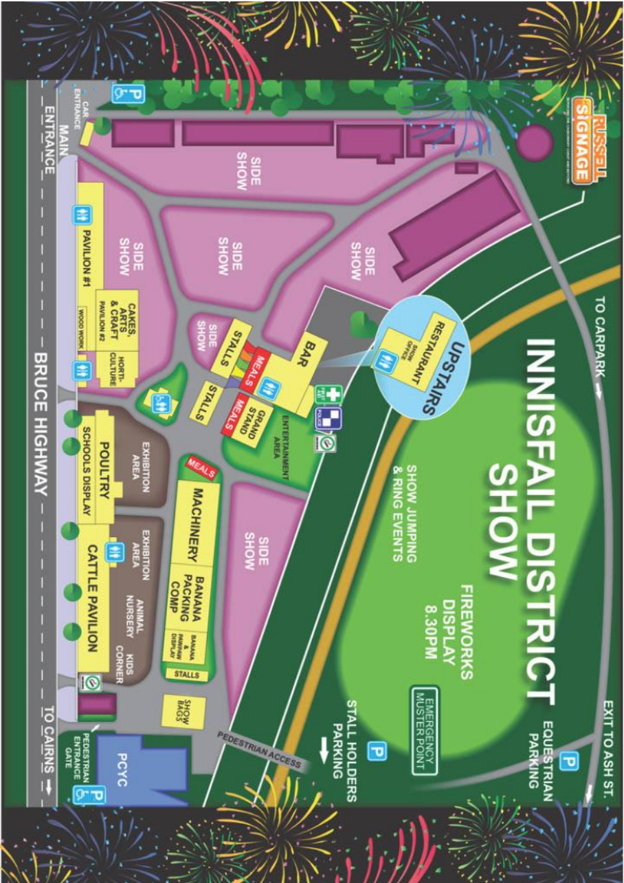
Thursday, 13 th July and Friday, 14 th July 2023 108 th Annual Show