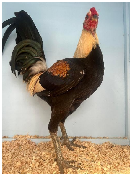
Thursday, 10 th July and Friday, 11 th July 2025 110 th Annual Show